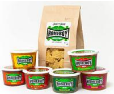
CHIPS AND SALSA

A distinctive feature of Homeboy Industries is its small businesses, where the most difficult to place individuals are hired in transitional jobs in a safe, supportive environment where they will learn both concrete and soft job skills. Here an individual can build a resume and gain work experience in the Homeboy Bakery, Homegirl Café & Catering, Homeboy Merchandise, and Homeboy Silkscreen & Embroidery. Proceeds from these businesses help fund the free services. Snak King supports Homeboy Industries with a donation of every bag of Homeboy Tortilla Strips sold.